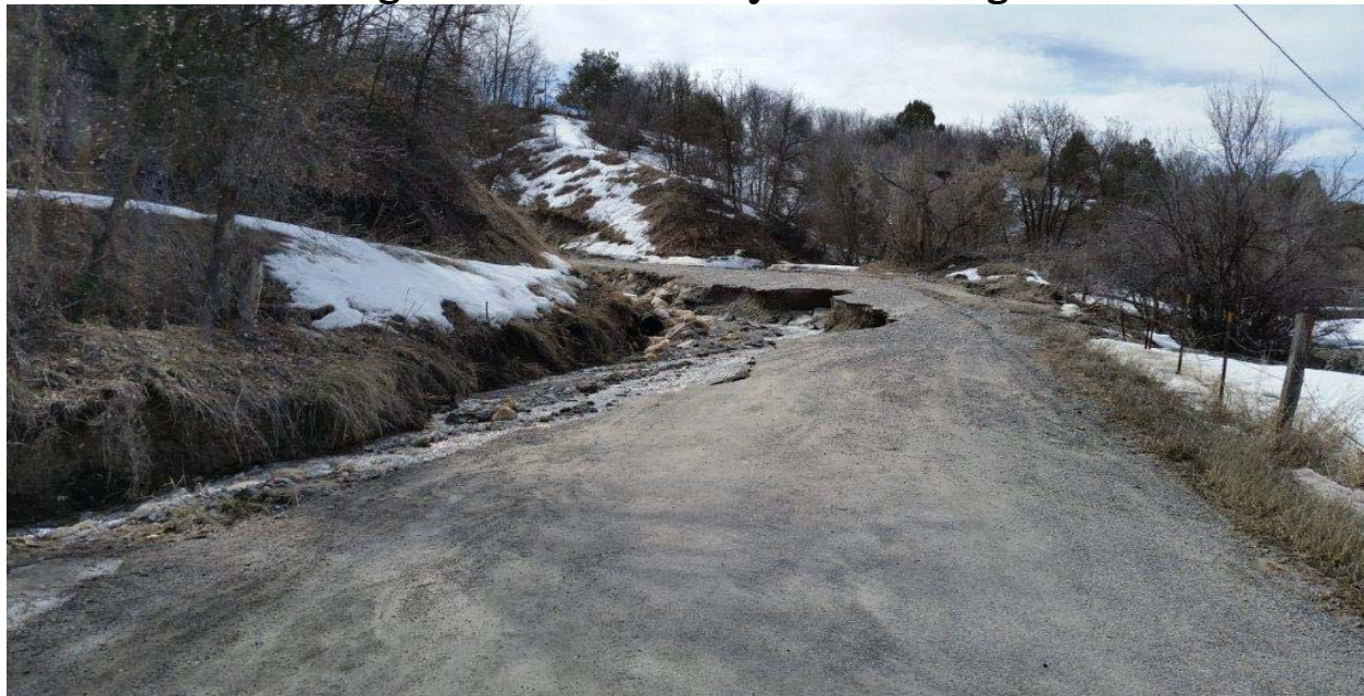
Figure 1: Cache County Road Damage

The County is located in northern Utah, near the Idaho border and encompasses the Bear River Mountains and Cache Valley. It is home to more than 120,000 residents. From February 7 to 27, 2017, severe winter storms, including heavy rains and melting snow, caused flooding that damaged many of the County's roads and ditches. The President approved a Major Disaster Declaration (4311-DR-UT) on April 21, 2017.