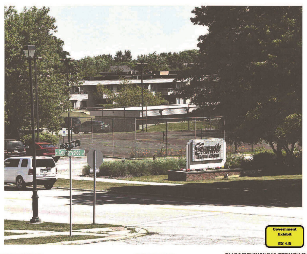
EX001B_0001 / 1 EX001B_0001