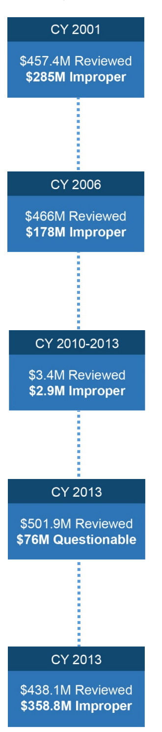
Figure 3: Prior Office of Inspector General (OIG) Reviews of Chiropractic Services

This review found that Medicare made $285 million in improper payments for chiropractic services that were medically unnecessary, billed with the incorrect procedure code, or undocumented. Seventy-four percent of the medically unnecessary services were for maintenance therapy. 14