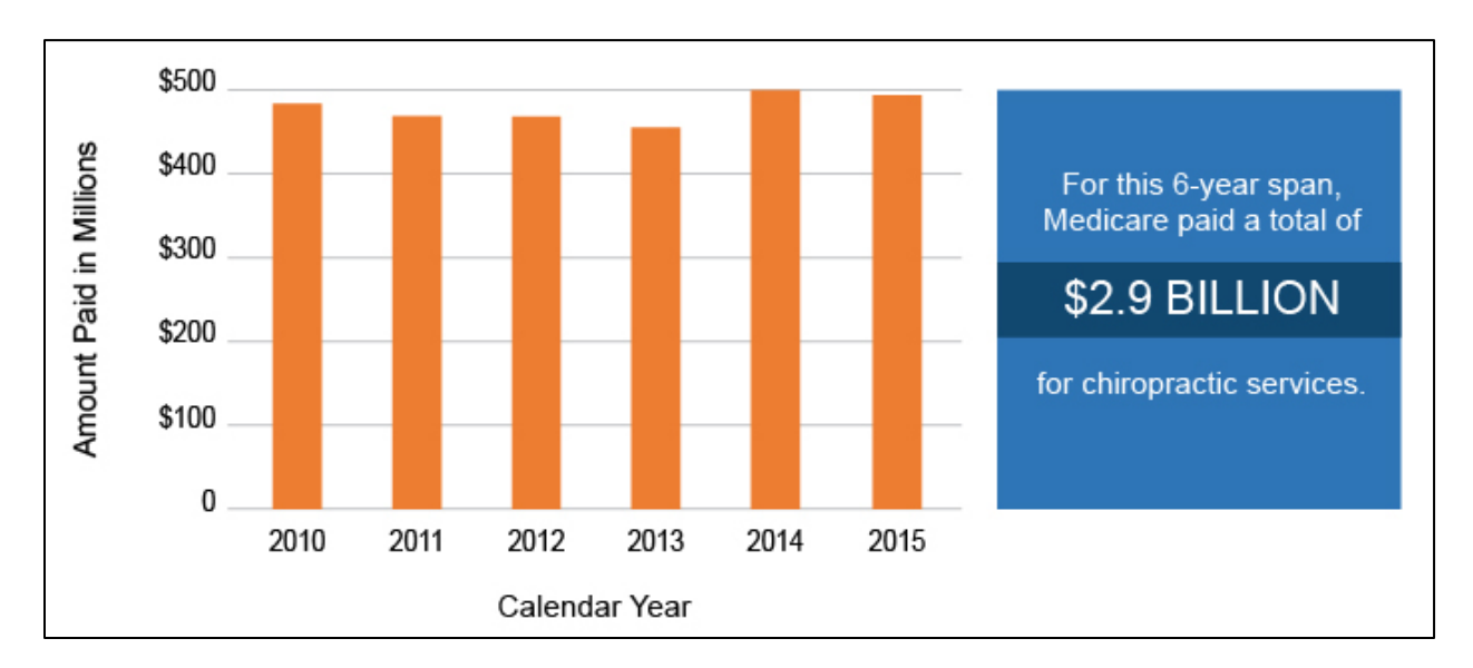
Figure 1: Paid Amounts for Chiropractic Services, CYs 2010–2015

From calendar years (CYs) 2010 through 2015, Medicare consistently paid more than $450 million per year for chiropractic services (Figure 1). In this 6-year span, Medicare paid a total of $2.9 billion for chiropractic services.