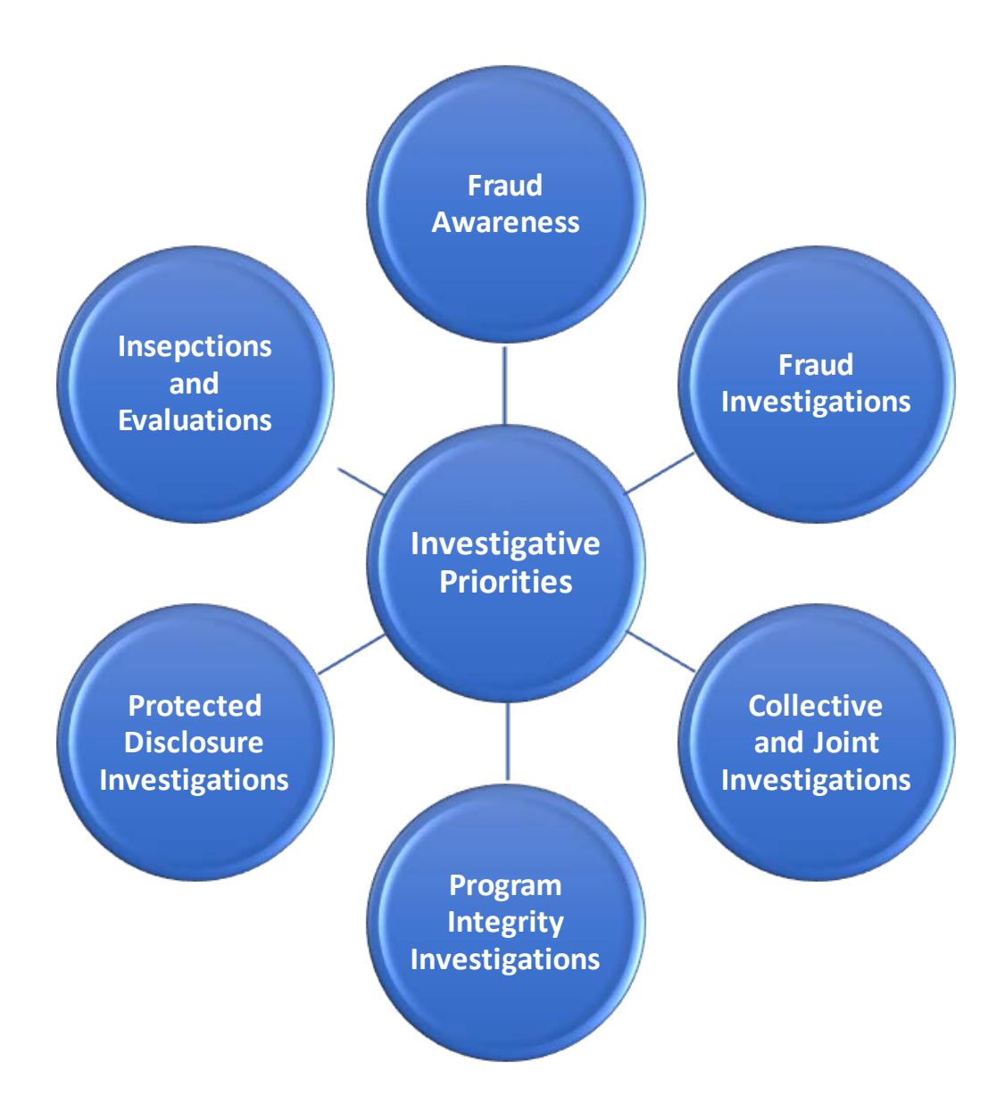
Figure – Investigative Priorities