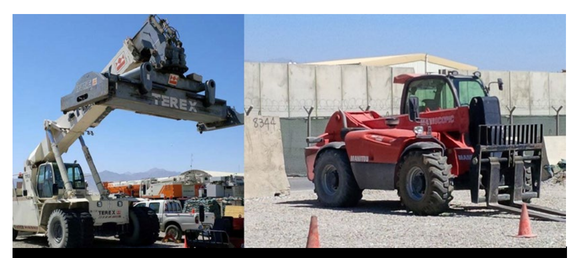
Figure 1. Examples of GFP: Shipping Container Mover (Left) and Forklift (Right)

The Federal Acquisition Regulation (FAR) defines GFP as property in the possession of, or directly acquired by, the Government and subsequently furnished to the contractor for the performance of a contract.<sup>3</sup> Examples of GFP furnished to LOGCAP contractors include heating and air conditioning units; construction vehicles, such as forklifts; and power generators. Figure 1 shows examples of GFP we observed in Afghanistan.