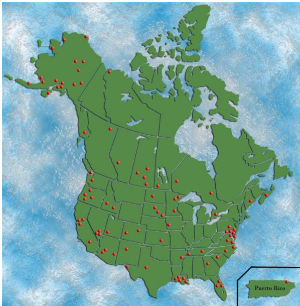
DOI Aircraft Maintenance Vendors

In Alaska, 30 percent of the aviation maintenance conducted on fleet aircraft is performed at NBC-AMD's hangar in Anchorage. The remaining maintenance work in Alaska and throughout the lower 48 states is done by one of more than a hundred different vendors located in 37 states, Canada, and Puerto Rico.