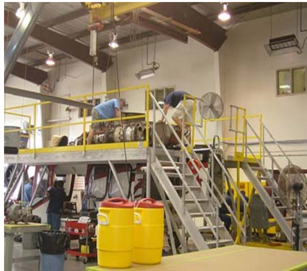
Vendor Maintenance Facility

respective tracking systems. In addition, the current processes rely in part on pilots alerting maintenance specialists as to when maintenance is needed. As a result, information is not timely, reliable, or accessible for planning purposes or to those who need access to the status of their aircraft.