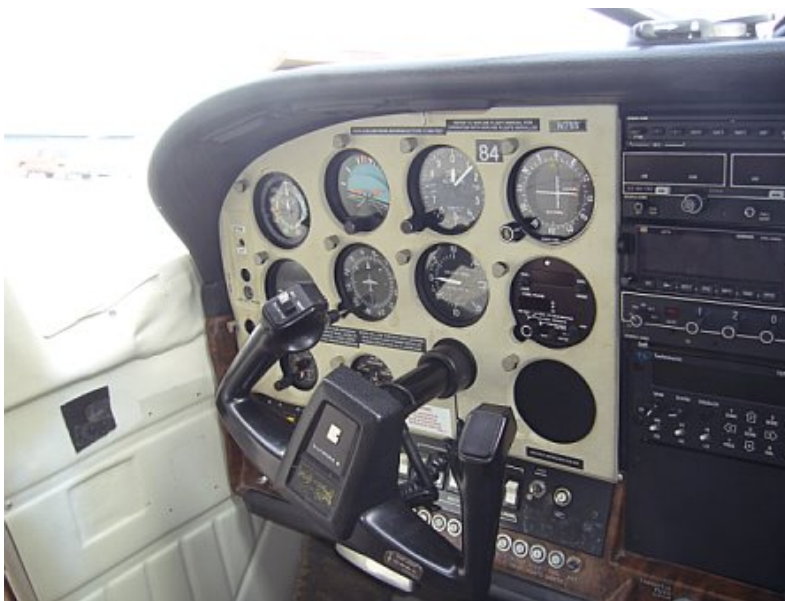
Controls of an NBC-AMD aircraft

Maintenance Programs, which allow users to access records via the Internet in real time. NOAA has used software called Flight Watch for the last 11 years to track aircraft maintenance. The program allows aircraft mechanics and others to track parts, schedule maintenance, and record pilots' flight hours. Flight Watch also includes other tie-ins, such as a financial tie-in, to keep track of expenses. The system was designed to interface with other systems used by NOAA personnel. One NOAA aviation official described the system as "unifying" in that it allows a range of users to input data and access information, such as pilots inputting their flight hours from their logbooks.