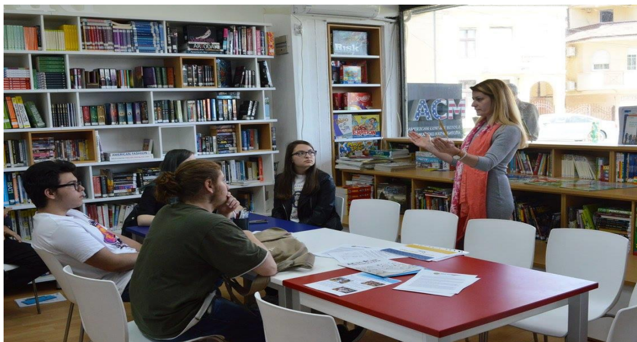
Figure 1: Members of American Corner Bitola's Competitive College Club listen to the Corner director discuss essay writing techniques.

Five American Corners (one in Skopje and four in interior cities) effectively extended Embassy Skopje's reach, especially to youth, with speaker programs on U.S. society and values, workshops on topics like entrepreneurship, English language activities, and educational advising. The mission successfully promoted steady travel and engagement by U.S. embassy staff and other Americans in Macedonia to keep the Corners active and visibly associated with the United States. The numbers tell the story: the Corners averaged more than one American participant daily, ranging from the Ambassador and embassy officers to Peace Corps volunteers and Fulbright English Teaching Assistants. In all, the Corners averaged 47 American visits per month (in addition to many visits by LE staff) between April 2016 and April 2017, spread evenly across the five Corners.