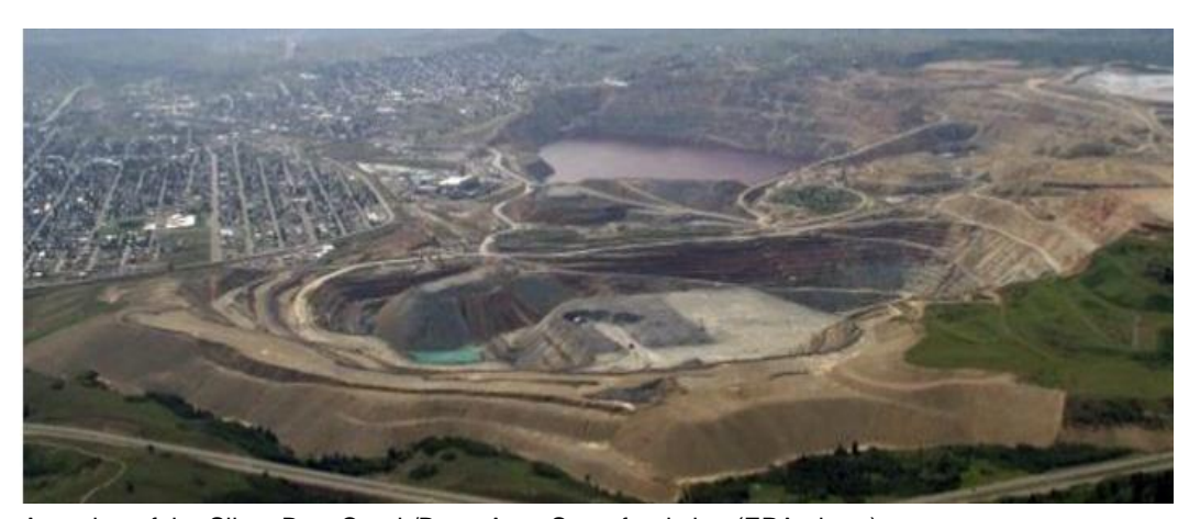
A portion of the Silver Bow Creek/Butte Area Superfund site.

Region 8 stated in its survey response that it had site work it could not start due to lack of FTEs at the Silver Bow Creek/Butte Area NPL site in Butte, Montana. Specifically, work is currently delayed at the West Side Soils Operable Unit (OU13), which includes the mining-impacted areas in and around the city. For the site, potential health threats include direct contact with and ingestion of contaminated soil, surface water and groundwater; and inhaling contaminated soil. Contaminants of concern include arsenic, cadmium, copper, lead and zinc. The EPA reports that it has insufficient data to determine whether human exposure is under control, and the site is not ready for anticipated use. Region 8 also added that other sites could be advancing more quickly through the NPL process if they had additional regional project manager FTEs to assist in the work.