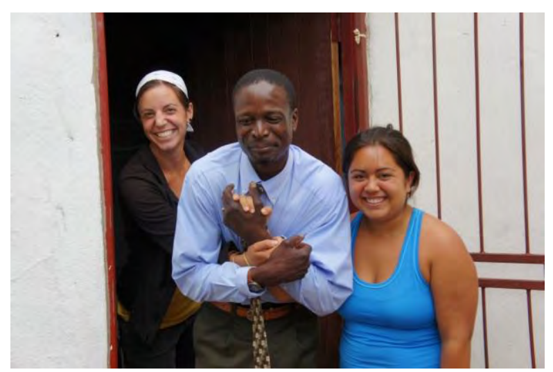
Peace Corps Swaziland staff and Volunteers