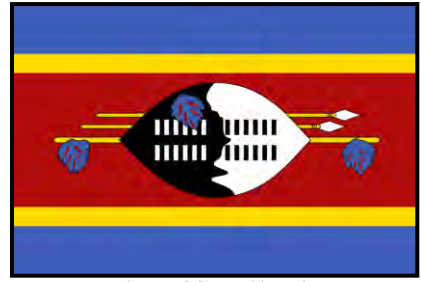
Flag of Swaziland