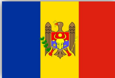
Flag of Moldova