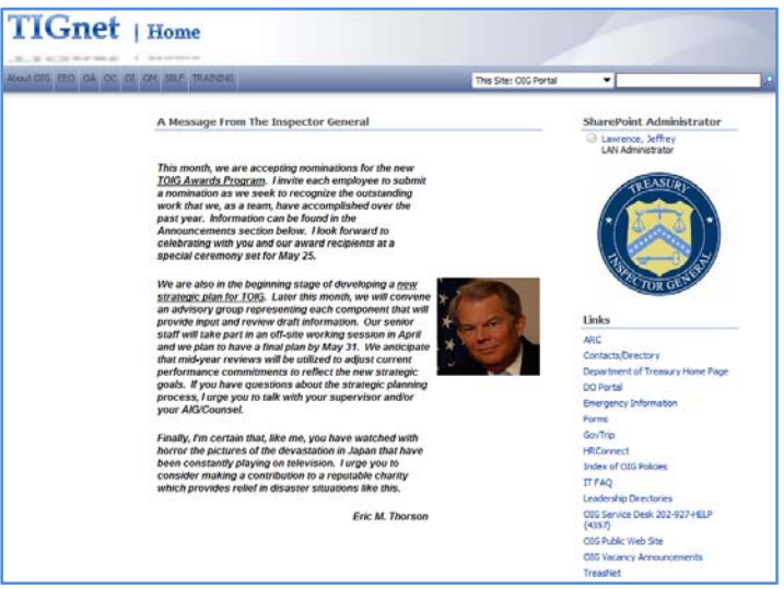
Pictured above is our TIGnet home page.

The Treasury Office of Inspector General Intranet Site (TIGnet), developed by OIG's Office of Management to provide a central location to efficiently and effectively disseminate information to all staff within the OIG, was launched on February 1, 2011. TIGnet is based upon a Windows SharePoint 2007 platform and serves as the official intranet site for all the components within OIG. The TIGnet site content will be maintained by the respective components and constantly updated with internal announcements and notifications. Our office has begun establishing document libraries, shared calendars, resource centers, and a technical helpdesk ticketing system. These new options have greatly improved the synergy within our office by making information centrally located and easily accessible to all OIG staff members. Moving forward, the ultimate goal of TIGnet is to create a completely webbased platform that will further encourage collaboration and improve efficiency within our organization using a commercial off-the-shelf platform.