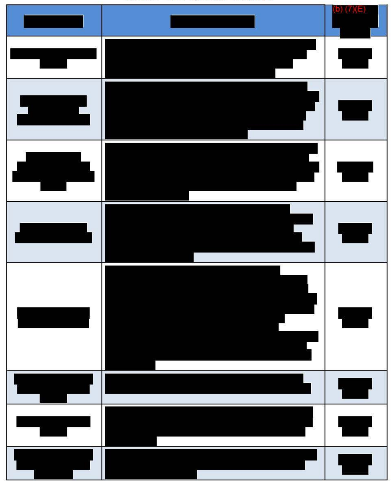
Table 2. SEC Systems Sampled