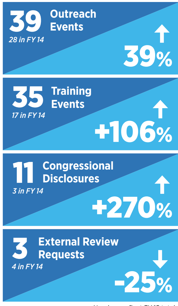
Numbers reflect FY 15 totals.

Requests for external OIG review under PPD-19 have increased significantly during this reporting period. Because PPD-19 requires a complainant to first go through or "exhaust" their agency's OIG review process, these requests are only recently becoming ready for the IC IG's