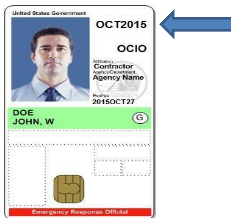
Figure 4. Sample PIV Card With Expiration Date

access to other Federal facilities. Often, the PIV card displays an expiration date, which could allow a terminated contractor or employee access into another Federal facility. This could have a significant impact on that agency's ability to maintain proper protection of its facility. Additionally, the PIV card could be used as identification (as a Government employee) in other public access facilities, such as an airport or hotel.