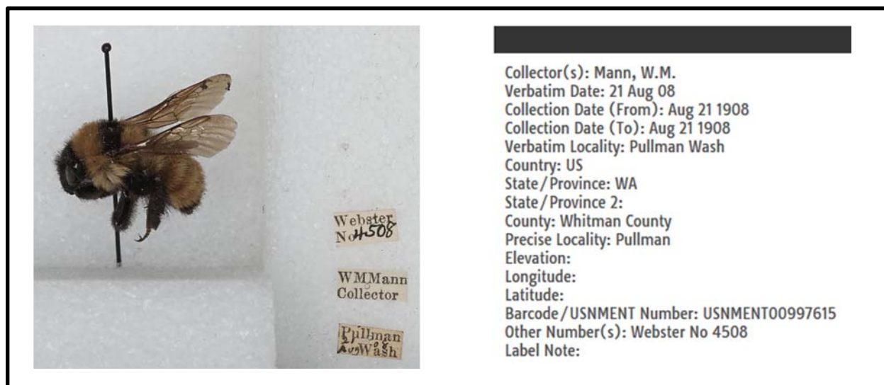
Figure 2: Digital Image of a Bumblebee Obtained through Rapid-Capture Project with Data Entered Through Transcription Center