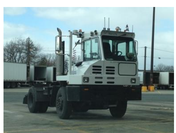
Figure 2. Spotter Truck at the Springfield NDC

The Springfield NDC has 58 drivers servicing 164 dock doors. These drivers are responsible for an average of 3,743 trailer moves in the yard per week and this includes moves for the STC.