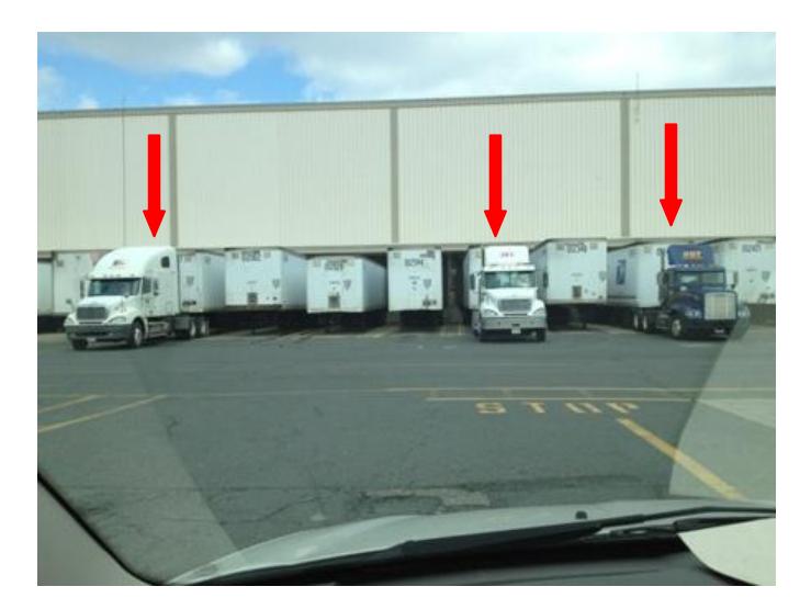
Figure 1. Three HCR Tractor Trailers Parked at Springfield NDC Dock Doors as Part of Live Load/Unload Program

NDCs are tasked with 'live unloading' and 'live loading' of all arriving and departing mail transportation trailers. Live unloading is when the highway contract route (HCR) or PVS driver brings a trailer directly to a dock door when it enters the facility for unloading. Live loading is when the HCR or PVS driver takes a loaded trailer directly from the dock door and out of the facility yard (see Figure 1). In either case, the trailer is not placed (or spotted) in the yard for movement at a later time. Not parking or spotting trailers in the yard ensures mail flows to the next operation or facility without delay and reduces total operating expenses at the same time.<sup>2</sup>