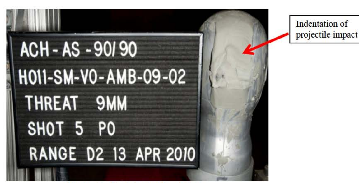
Figure 3: Post shot of head form.

Both investigations determined that FPI had endemic manufacturing problems at FCI Beaumont, and that both the ACH and LMCH were defective and not manufactured in accordance with contract specifications. The investigations found that the ACH and LMCH had numerous defects, including serious ballistic failures (Figure 3), blisters and improper mounting-hole placement and dimensions, as well as helmets being repressed. Helmets were manufactured with degraded or unauthorized ballistic materials (Figures 4 and 5), used expired paint (on LMCH) and unauthorized manufacturing methods. Helmets also had other defects such as deformities and the investigations found that rejected helmets were sold to the DOD.