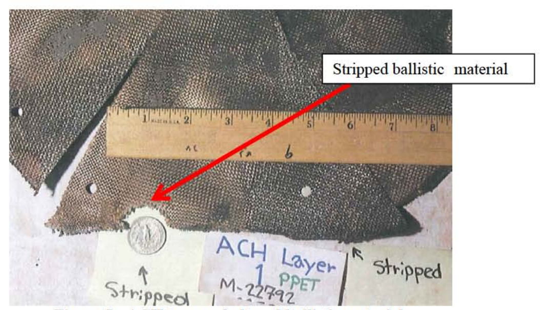
Figure 5: ACH torn and altered ballistic material.

The investigations also found that FPI pre-selected helmets for inspection, even though the DOD and ACH contract required helmets to be selected randomly, and substituted helmets to pass testing. The investigation also found that manufacturing documents were altered by inmates at the direction of FPI staff that falsely indicated helmets passed inspection and met contract specifications. Additionally, ArmorSource did not provide adequate oversight of the manufacture of the ACH, which resulted in helmets that were not manufactured according to contract specifications. Further, the investigations also found that Defense Contract Management Agency inspectors did not perform proper inspections, lacked training, and submitted false inspection records wherein they attested that ACH lots were inspected when in fact they were not. At least in one instance an inspector certified the lots as being inspected over a fax machine.