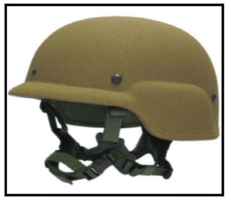
Figure 2: Light Weight Marine Corps Helmet.

Both investigations determined that FPI had endemic manufacturing problems at FCI Beaumont, and that both the ACH and LMCH were defective and not manufactured in accordance with contract specifications. The investigations found that the ACH and LMCH had numerous defects, including serious ballistic failures (Figure 3), blisters and improper mounting-hole placement and dimensions, as well as helmets being repressed. Helmets were manufactured with degraded or unauthorized ballistic materials (Figures 4 and 5), used expired paint (on LMCH) and unauthorized manufacturing methods. Helmets also had other defects such as deformities and the investigations found that rejected helmets were sold to the DOD.