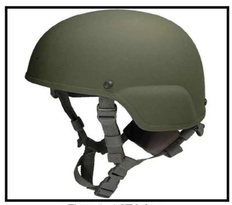
Figure 1: ACH helmet.

The ACH helmet (Figure 1) is a "critical safety item" designed to replace the Personnel Armor System Group Troop (PASGT) helmet and to provide an improved helmet to soldiers. The ACH is a personal protective equipment system that provides ballistic and impact protection for the head, including increased 9mm protection. The ACH is also a mounting platform for electronic devices that is designed to be compatible with existing night vision equipment; communication equipment; nuclear, biological, and chemical defense equipment; and body armor. The ACH also provides improved field of vision and hearing capability. The use of unauthorized manufacturing practices or defective materials reduce the ballistic and fragmentation protection the ACH is designed to provide, potentially resulting in serious injury or death.