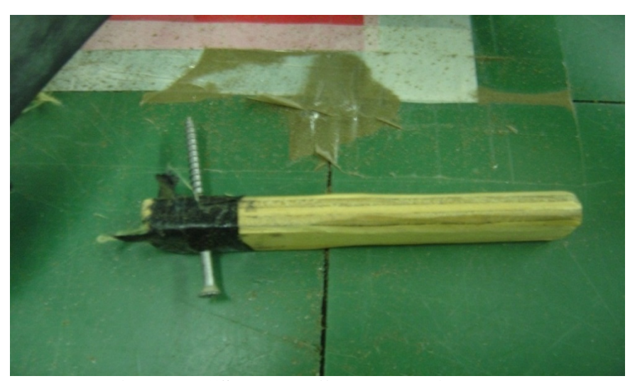
Figure 8: "Screw tool" used to strip Kevlar