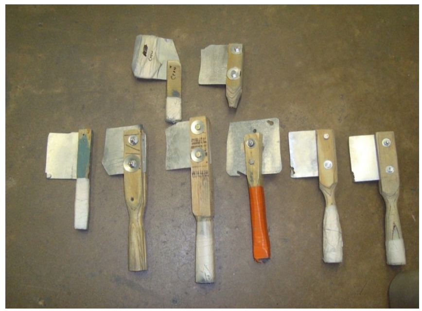
Figure 7: Hatchets used to remove paint.