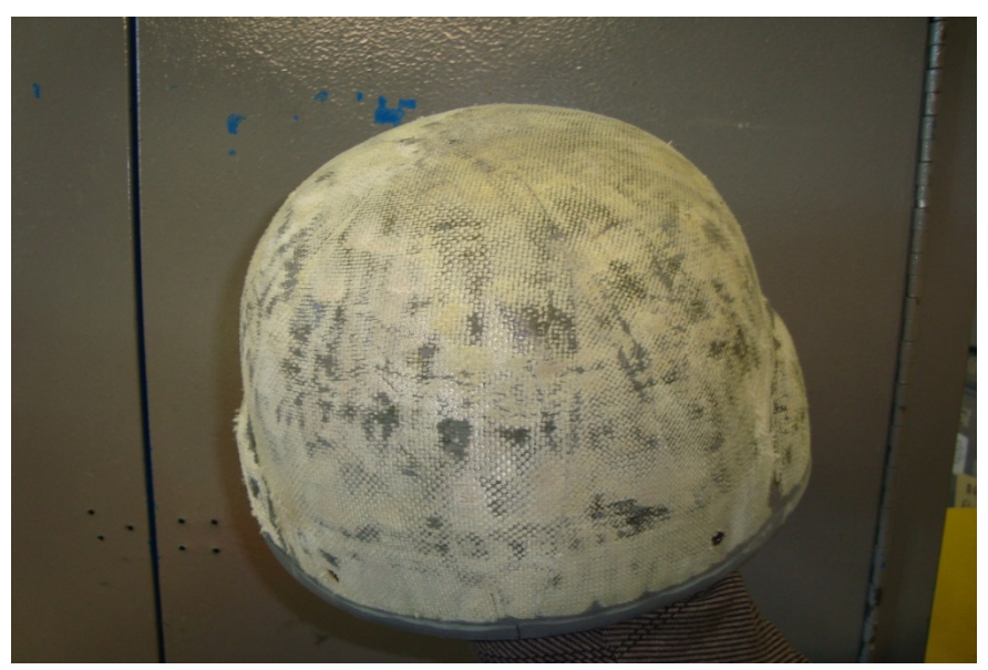
Figure 9: Damaged ACH after paint removal.

These investigations did not develop any information to indicate military personnel sustained injury or death as a result of the defective ACH helmets. However, 126,052 ACH helmets were recalled, and monetary losses and costs to the government totaled more than $19,083,959. The initial shipment of LMCH helmets to the DOD resulted in a complete quarantine of the 23,000 helmets and stoppage of any additional deliveries.