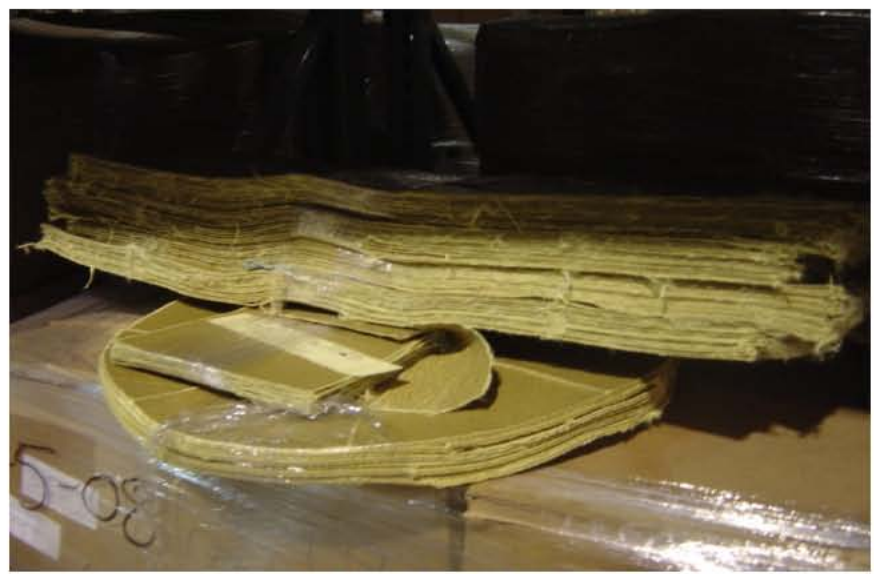
Figure 4: LMCH Kevlar bonded together.