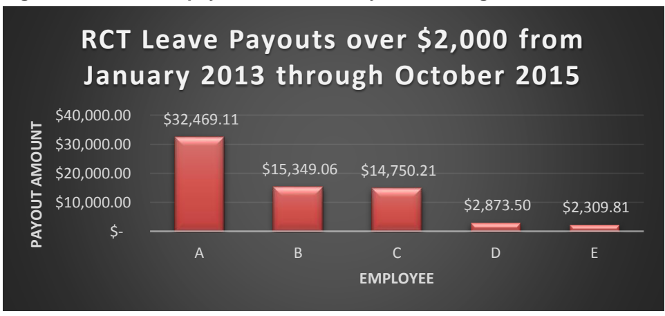
Figure 2: EPA's RCT payouts from January 2013 through October 2015

Even though the hour-for-hour requirement of 5 CFR § 550.1002 was not enforced, from January 2013 to October 15, 2015, the EPA paid 14 employees $73,514 for banked RCT hours (including the $32,469 for the OCSPP employee as discussed in Chapter 2). The majority of employees received a lump sum payment less than $2,000, which could be considered immaterial. However, five employees received a payment over $2,000 for banked RCT, with three receiving payments in excess of $14,000 each. Figure 2 below shows the amount paid to each of the five employees.