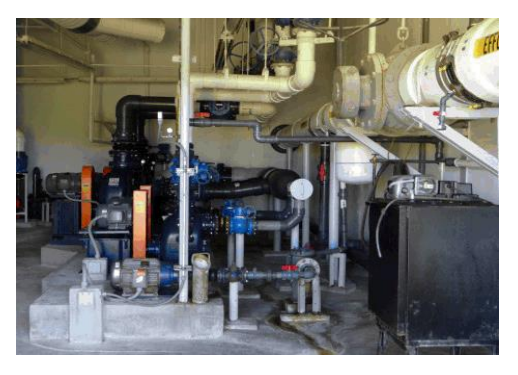
Interior view of wastewater treatment plant, Saipan.

We reviewed the Federal Managers' Financial Integrity Act Annual Assurance Letters from FYs 2012 through 2014 for Region 9 to determine whether those letters identified any weaknesses related to CNMI. The letters did not identify any weaknesses.