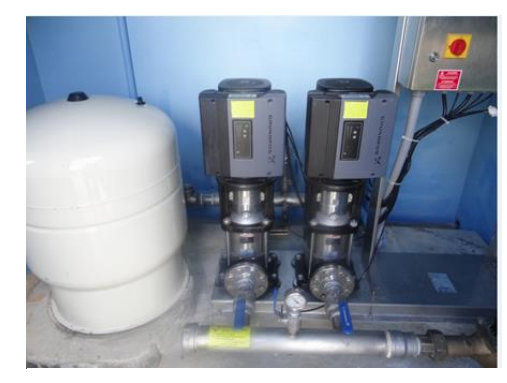
Pump station at S-8 lift station, Saipan.

We toured 18 project sites on CNMI. Sites included sewer replacements and connections, wastewater treatment plants, lift stations, water tank and waterline replacements, and a chlorine storage facility.