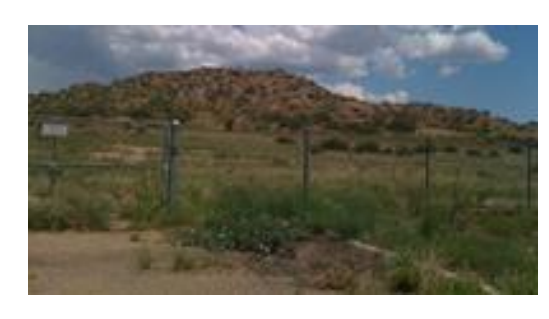
Photo of the former Intel Mountain View Plant, Mountain View, California.

As the EPA promotes and encourages the redevelopment and reuse of contaminated properties, it must strengthen its oversight of the long-term safety of sites, particularly within a regulatory structure in which non-EPA parties have key responsibilities and authority but can lack resources to effectively carry out long-term oversight of reused contaminated sites.