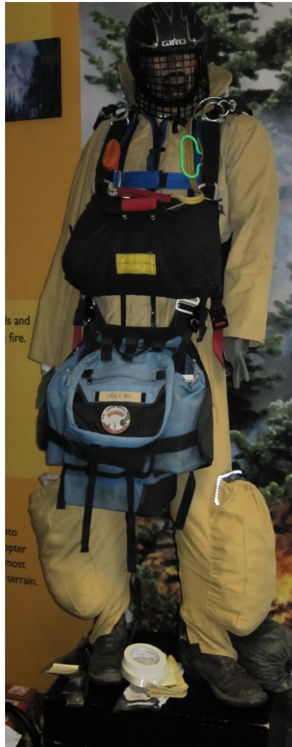
Smokejumpers firefighter uniform.