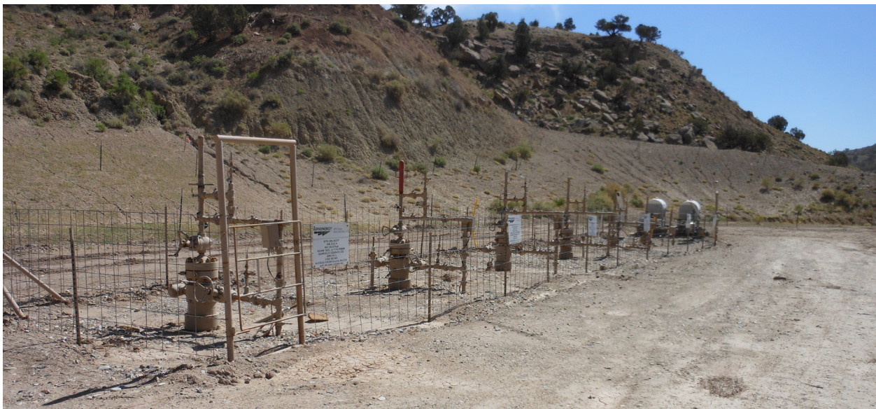
Operational oil wells onsite near Silt, CO.

Until recently, DOI has minimally addressed the APD process with an Instruction Memorandum in 2013, but the memorandum did not go far enough to improve the process significantly. We offered six recommendations focusing on establishing accountability and performance timelines and measures related to the APD process at the field-office level, modifying the oil and gas database to enable accurate and consistent data entry and APD tracking, and implementing best practices to streamline the review process. BLM agreed with five of our six recommendations and has already begun to address our concerns. We believe that full implementation of our recommendations will expedite the review process and facilitate proper development of our domestic energy resources.