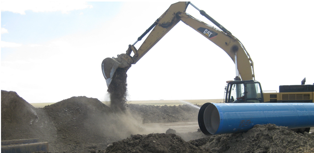
Construction on the Rocky Boy's/North Central Montana Regional Water System.