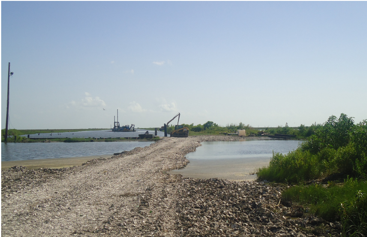
The Fringe Marsh Repair project in Plaquemines Parish will restore approximately 300 acres of wetland area.

The areas of concern we identified in Louisiana include ineffective grant monitoring by FWS, State procurement laws that do not require full and open competition, unallowable costs and mishandled accounting and financial issues, improper acquisitions of real property, ineligible drawdowns, and inappropriate changes in grant scope.