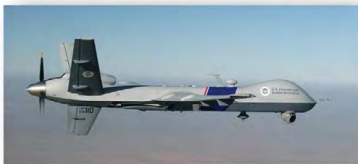
Figure 1: Predator B Unmanned Aircraft

CBP began UAS operations in fiscal year (FY) 2004 with a pilot study to determine the feasibility of using UAS along the southwest border of the United States. The study concluded that the unmanned aircraft could carry sensors and equipment and remain airborne for longer periods than CBP's manned aircraft. CBP reported that, from FYs 2005 to 2013, it obligated about $360 million for the purchase of unmanned aircraft and related equipment, and for personnel, maintenance, and support. At the time of our audit, CBP had a fleet of 10 unmanned aircraft. 1 Five were configured for land missions, two for maritime missions, and three could operate over both land and water.