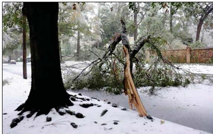
Figure 1: Downed Tree Limb Blocking Road Access in Augusta-Richmond County, Georgia