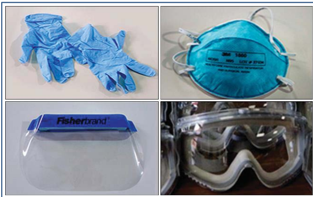
Figure 3: PPE Used During Ebola Screening

The DHS Ebola Entry Screening Guidance advises that to the extent feasible, CBP officers should maintain a distance of not less than 3 feet between themselves and travelers, absent a physical barrier. In addition, the DHS guidance outlines the PPE requirements for the Ebola screening intended to ensure personal protection and minimize risk. Figure 3 shows some of the PPE used during the CBP Ebola screening process.