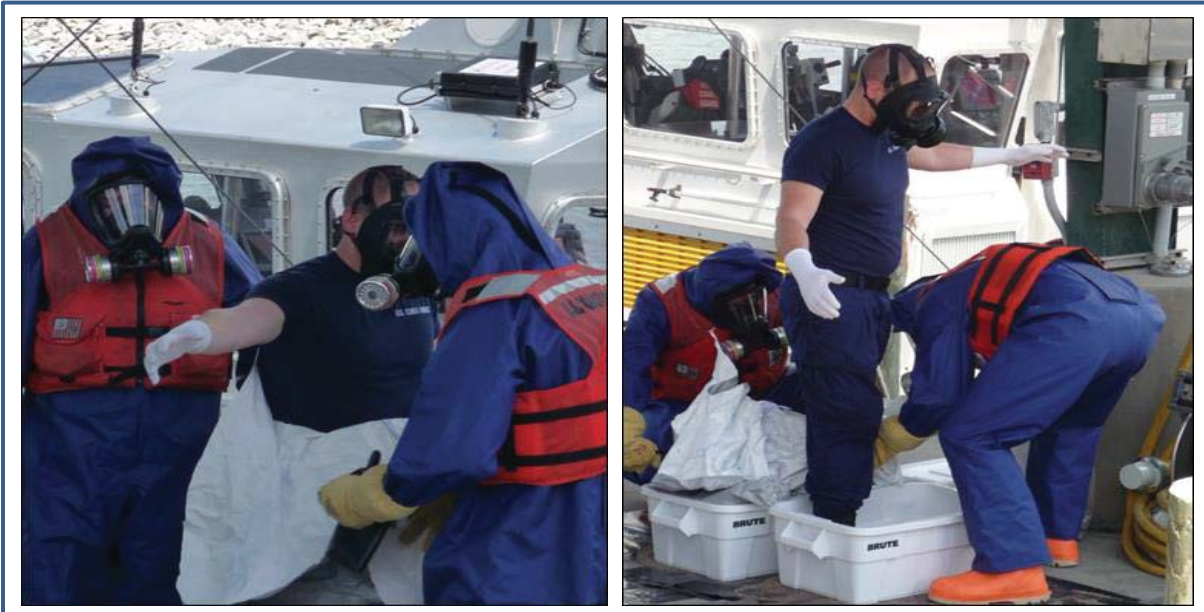
Figure 2: CBRN Removal