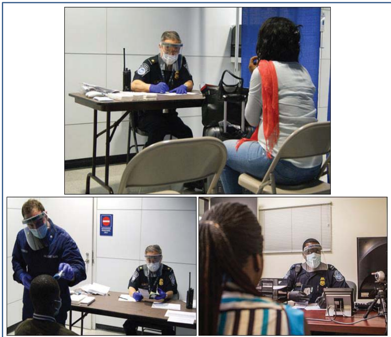
Figure 4: Ebola Screening Process

keep 3 feet of distance or wear additional PPE when conducting Ebola screening. According to CBP, although it understands the importance of “safe-distancing” to minimize potential exposure to a communicable disease, operational application of a standardized procedure is subject to “real-world” environmental constraints. The result being that the officer must close the recommended safe-distance to accomplish the mission objective of escorting the traveler to an area for isolation. Although CBP Ebola screening procedures referred to DHS guidance, it did not specify the 3-foot requirement. As a result, CBP officers may have overlooked this requirement and did not always maintain the recommended distance or wear additional PPE as required. Figure 4 illustrates the use of PPE during the Ebola screening process.