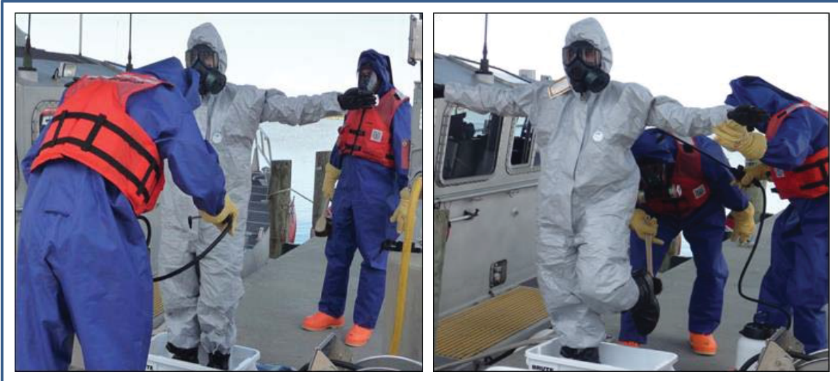
Figure 1: CBRN Decontamination Demonstration