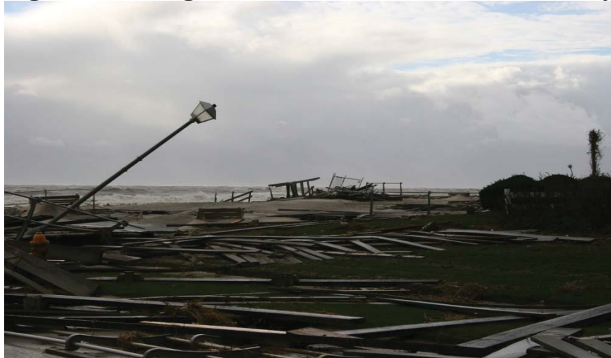
Figure 1: Damaged Boardwalk after Hurricane Sandy

Spring Lake is located in Monmouth County, New Jersey. Hurricane Sandy's high winds and widespread landfall caused severe storm surge, flooding, structural damages, and large volumes of storm-related debris. Floating debris and breaking waves exceeding 14 feet in height pushed the entire 2-mile length of the Borough's boardwalk off its concrete supports and broke it apart.