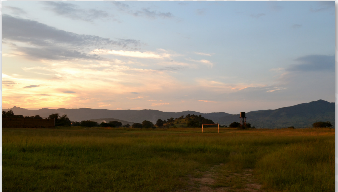
A Volunteer site in Southern Africa