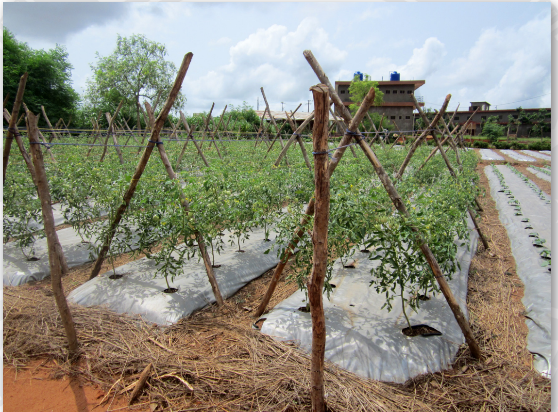
A technical training site in Peace Corps/Benin