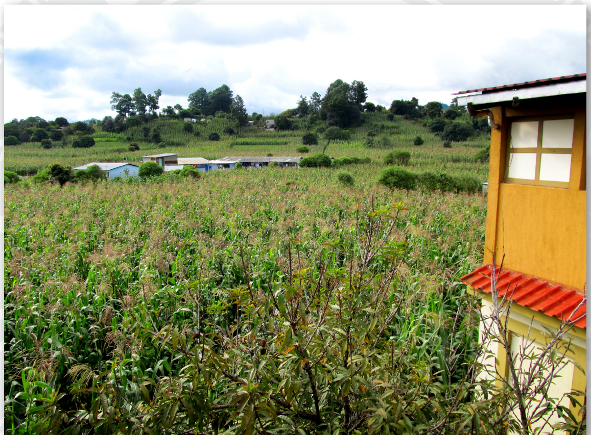
A Volunteer site in Central America