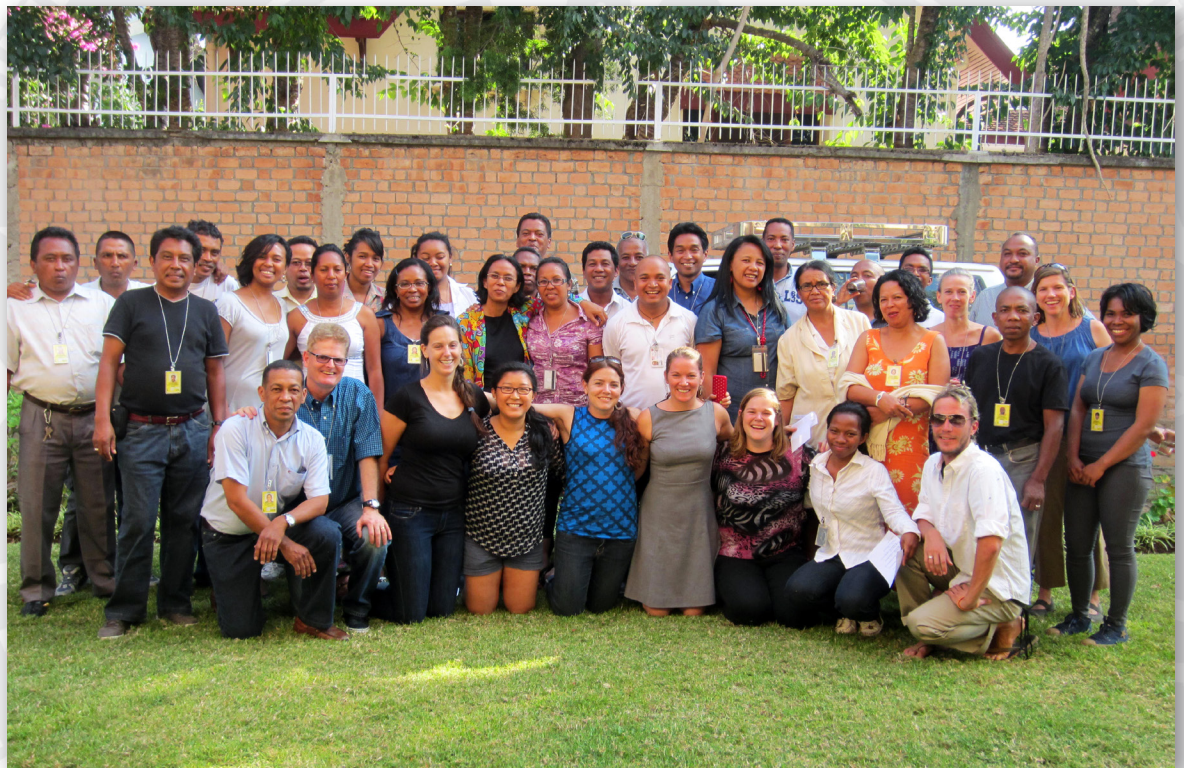
Post staff from Peace Corps/Madagascar during an OIG audit