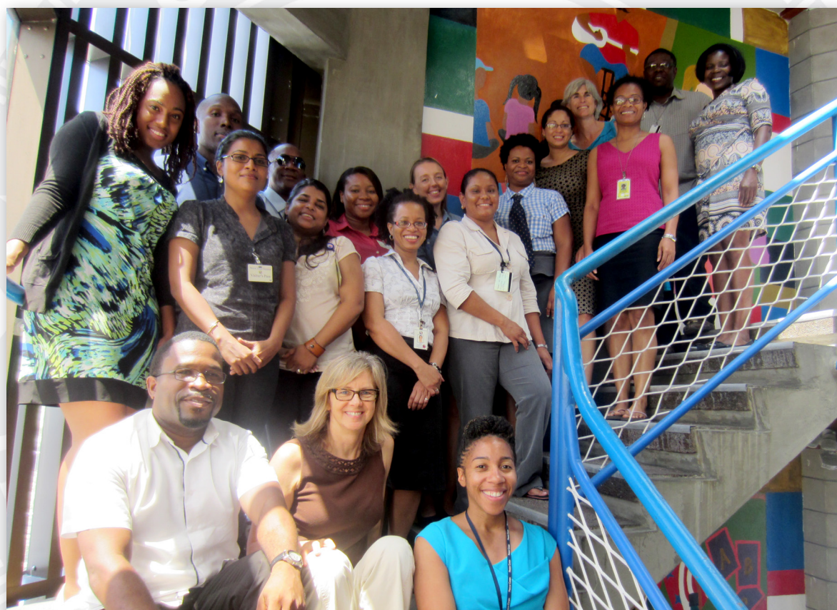
Peace Corps OLIG auditors and post staff in Peace Corps/Guyana