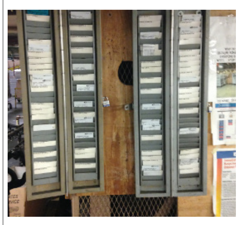
Figure 4. Unlocked Timecard Racks