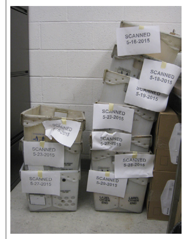
Figure 2. 2-Month Backlog of Customer Notifications for Damaged Mail