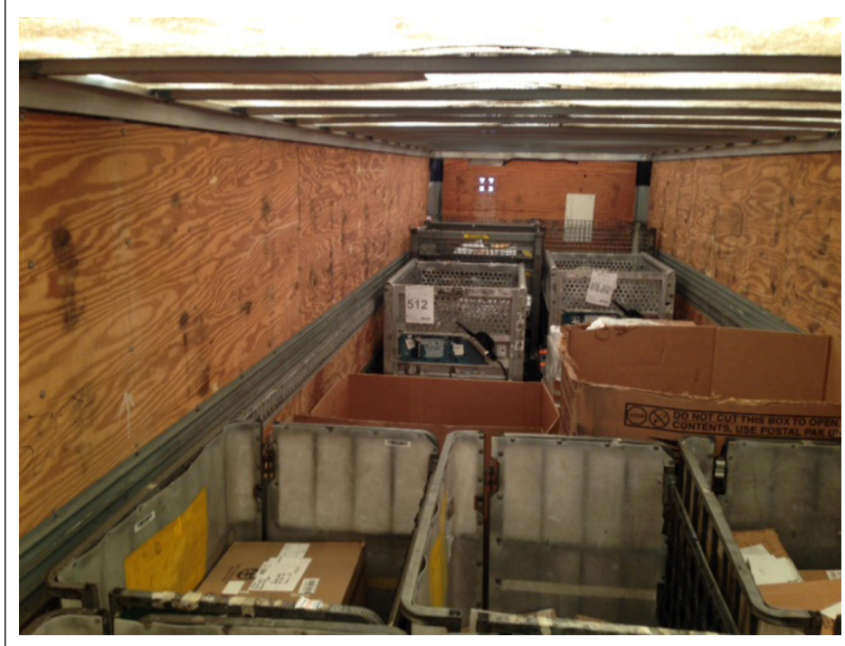
Figure 3. Load Not Properly Restrained in Trailer

Employees were not properly using load restraints.