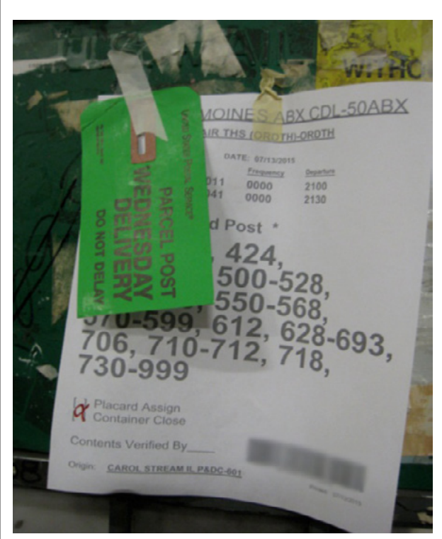
Figure 5. Incorrect Color Code Tag Used and No Time and Date on a Tag