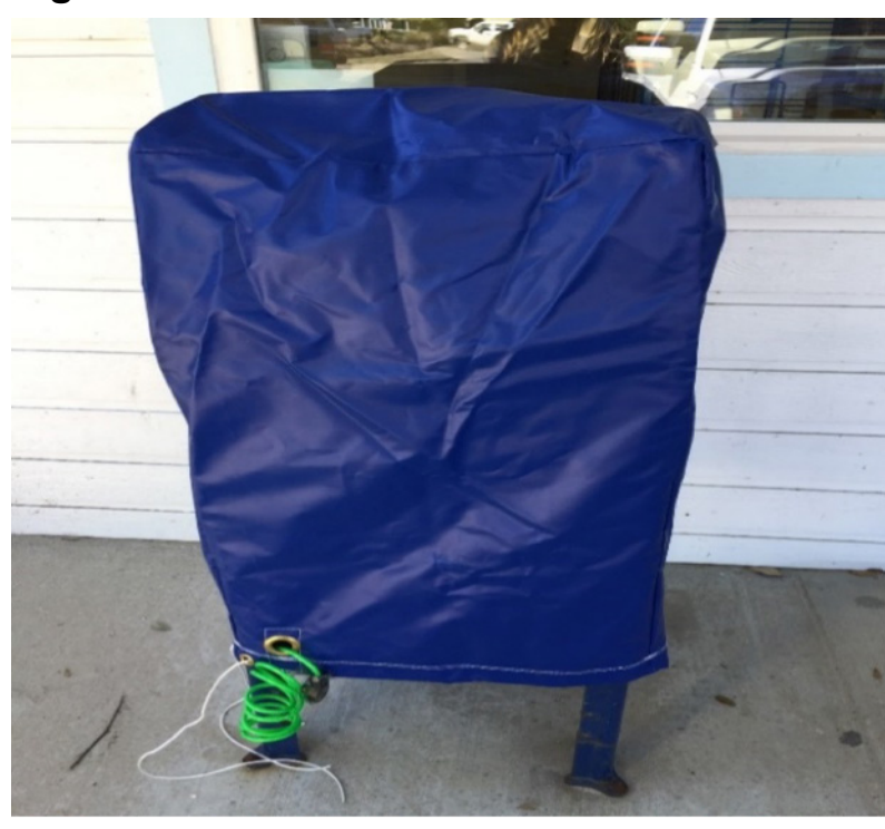
Figure 4. Out-of-Service Collection Box

If a collection box is temporarily unable to be collected from, the Postal Service can place the box into an out-of-service status, until collection services are restored. For example, the Greensboro District has purchased custom secured canvas bags for collection boxes that have to be taken out-of-service due to weather emergencies (see Figure 4).