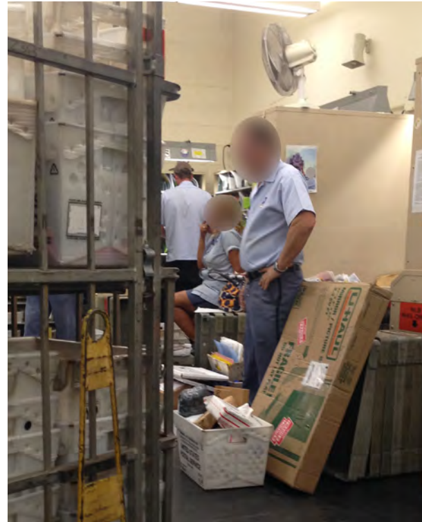
Source: U.S. Postal Service Office of Inspector General (OIG) photograph taken September 24, 2015.