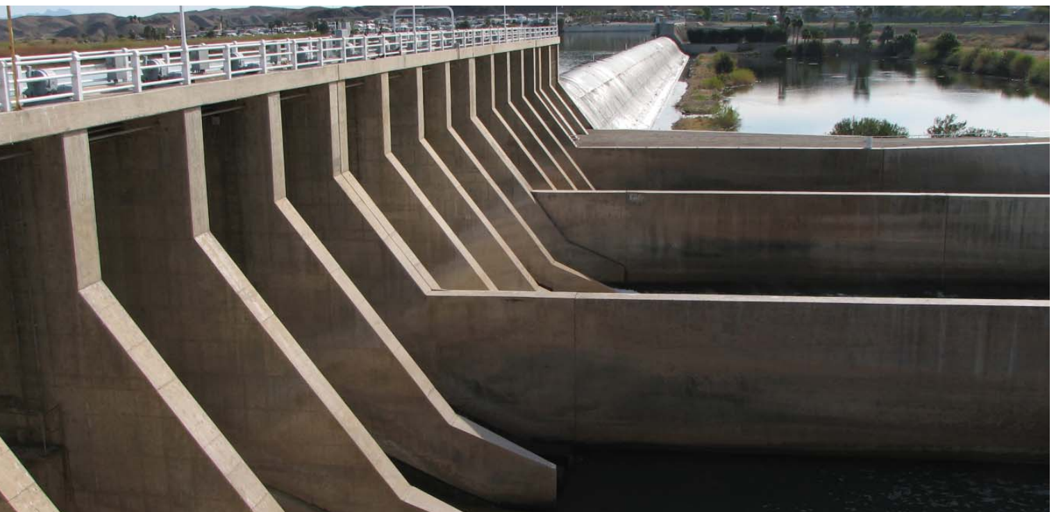
The Imperial Dam on the Colorado River, northeast of Yuma, AZ.

We found that OSM, BLM, and NPS either have no requirement for EAPs to be in place for all high-hazard dams under their purview, or have not adequately reviewed, exercised, or formalized the EAPs that are in place. We also found that none of the three bureaus have a written policy requiring after-action reports to be prepared following EAP exercises, and when after-action reports are prepared, recommended corrective actions in these reports are not tracked for implementation.