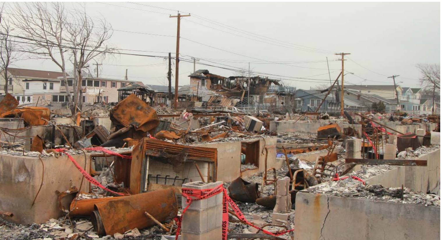
Damage to Breezy Point, NY, resulting from Super Storm Sandy.

In the wake of one of the costliest natural disasters in U.S. history, DOI mobilized resources to expedite storm recovery on impacted Federal and tribal lands. OIG responded accordingly, as those emergency declarations invoked acquisition flexibilities authorized in the Federal Acquisition Regulation and gave rise to unusual and compelling needs for supplies and services.