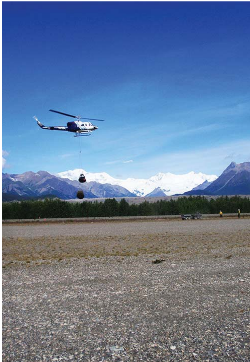
Alaska Fire Crew team at work.

To further safeguard the check-writing program from fraud, waste, and mismanagement, OIG recommended that all check-writing bureaus evaluate their monthly reconciliation process and that DOI require training more frequently than every 3 years for check writers and their approving officials. DOI concurred with both recommendations.