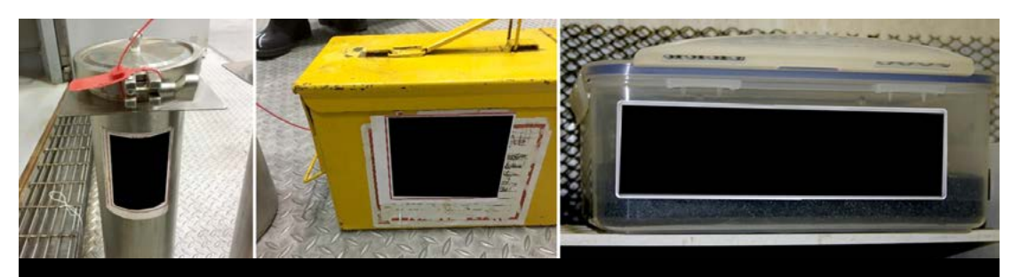
Figure 2. Stainless Steel Cylinder, Ammunition Can, and Plastic Storage Container Used as Secondary Containers at Dugway and the Contractor Sources (from left): Dugway Proving Ground (photos 1 and 2), and Contractor (photo 3).

stated that there could be differences in processes and procedures between Dugway and the contractor because the latter is a contractor facility. However, the official also stated that re-sealable plastic containers and tape were not the correct materials to use for secondary containers. Although tamper-evident seals, such as those used at Dugway, show whether someone attempted to gain unauthorized access to a chemical agent, the use of tape by the contractor would only show if someone accessed the chemical surety materials. It would not prevent someone from attempting to gain unauthorized access.