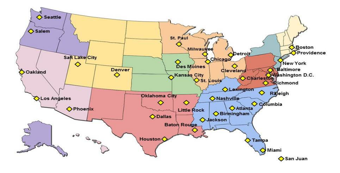
Figure 1: CDI Units as of March 2016

In Fiscal Year (FY) 1998, the Social Security Administration (SSA) and Office of the Inspector General (OIG) jointly established the CDI program. The CDI program pools the resources and expertise of SSA, OIG, State disability determination services (DDS), and State or local law enforcement agencies to prevent fraud in SSA's disability programs. CDI Units investigate disability cases under SSA's Title II and XVI programs. A primary mission of the CDI program is to obtain evidence that can resolve questions of potential fraud before benefits are paid. CDI Units also provide DDS examiners reports on questionable in-payment cases during continuing disability reviews (CDR). As of March 2016, there were 37 CDI Units covering 32 States; Washington, D.C.; and the Commonwealth of Puerto Rico (see Figure 1). SSA plans to add one additional CDI Unit in FY 2016.